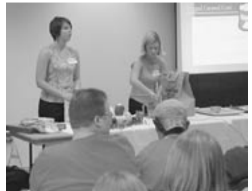
FCS teacher education students giving a presentation.