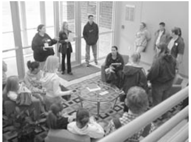
One of many tour groups touring the FCS Building.

The Career Day events also provide opportunities for our current students to share with prospective students what excites them about their area of study and their future professions. Students in Senior Seminar are now exploring ways to attract students to campus through competitions in the areas of early childhood, fashion merchandising, and interior design. We are excited by the growth of our students and their commitment to their future professions. There is a difference between a program surviving the changes in our world, and one that seeks to thrive and form their own place in that world. Our students are definitely focused on thriving.