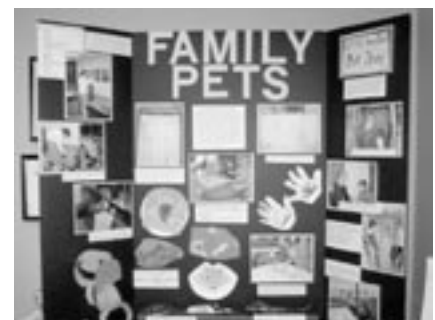
This panel tells part of the story about what the children learned in the preschool when they studied family pets.