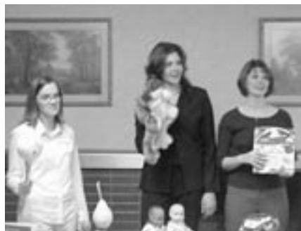
Early childhood students presenting about activities.

Plan to join us for the next Career Day! November 21, 2005