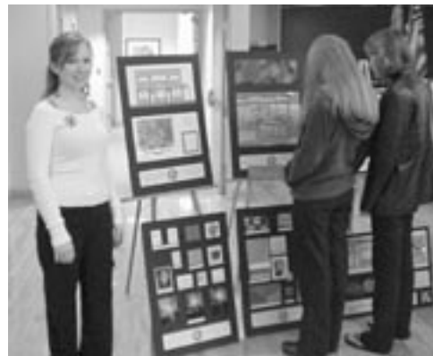
Interior design display and student presentation.