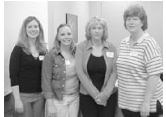
Recent FCS teacher ed graduates return to PSU with their classes for Career Day.