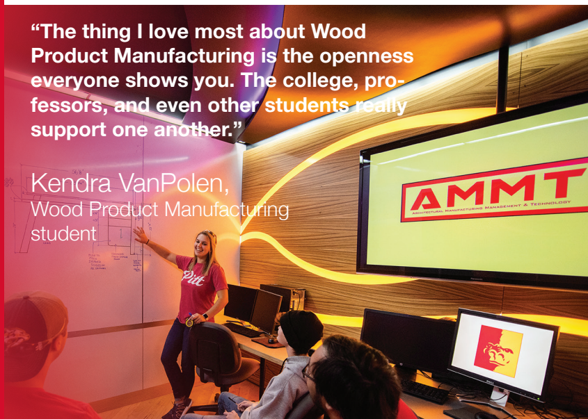
Pictured above is the computer lab, constructed by Wood Product Manufacturing students.