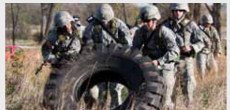
The Ranger Challenge Team conducting the tire flip during the Combat Crucible event at Camp Dodge, IA