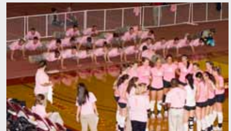
The Gorilla Battalion Push-Up Platoon supports a PSU volleyball game. All were wearing pink shirts as part of the game's fund raiser for Breast Cancer Awareness Month

who shines on campus. Thanks for passing the word, telling the ROTC story, and explaining the leadership and career benefits of ROTC. Students on campus are more apt to listen to you than any other source. So tell the story, and if you have anyone interested get in touch with the Enrollment Officer.