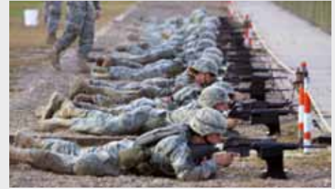
The Ranger Challenge Team on the firing line preparing to fire for score at Camp Dodge, IA

These pavers pay great tribute to a veteran that you know personally and will remain there for years to come. If you are interested in purchasing one of the pavers they come in two sizes: an 8"x8" paver for $150 and 12"x12" paver for $300. For additional information on pavers, call the PSU Office of University Development at 620-235-4768, or email lmetro@pittstate.edu .