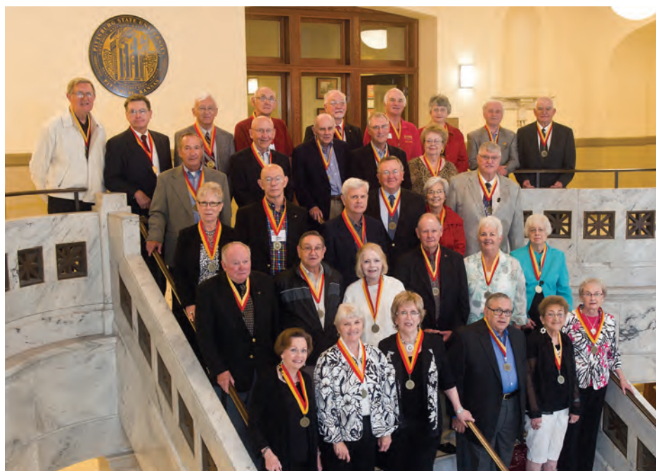
Members of the Class of 1961 gather on the iconic marble steps of Russ Hall for a photo during their Half-Century Club reunion in May.