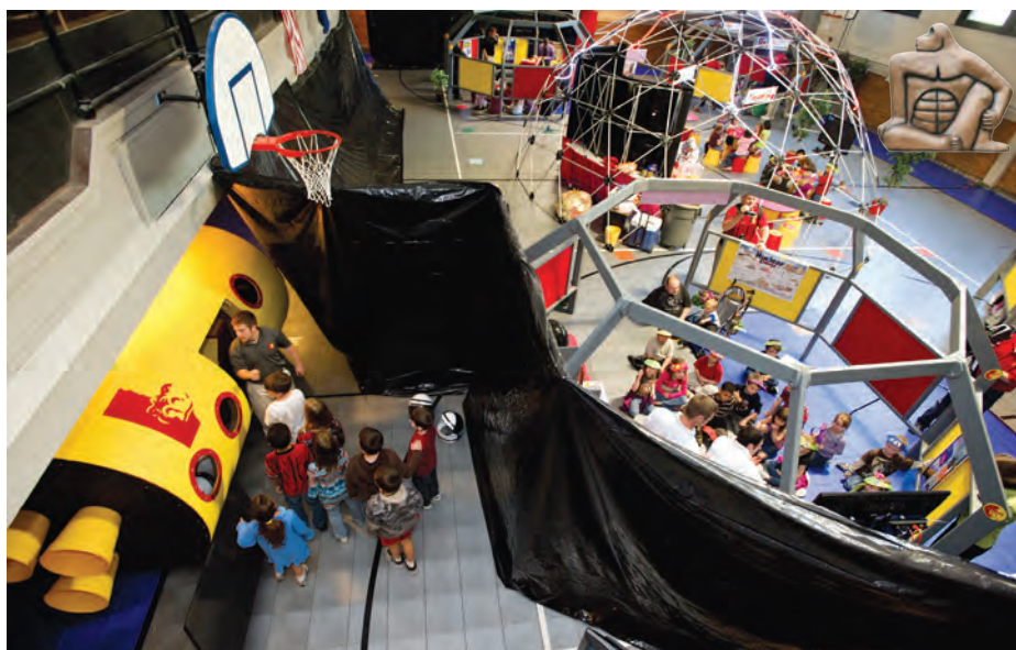
Students at Lakeside Elementary School embark on an exciting voyage to space as part of a unique educational experience designed by PSU Technology Education students.