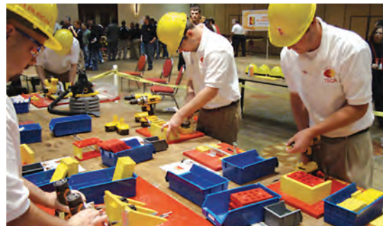
Members of the Manufacturing Team work on their winning project at the International Technology and Engineering Educators Association Conference.