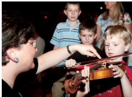
Fascinated youngsters learn about symphonic instruments at an unusual petting zoo.