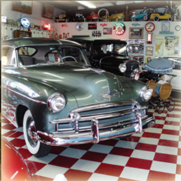
SCOTTY'S CLASSIC CAR MUSEUM

CONSIDER THESE FREE CRAWFORD COUNTY ATTRACTIONS.