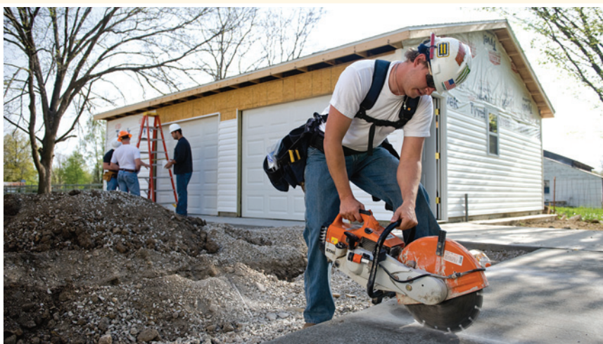
Students put their knowledge and skills to work for community service.

For more information, call the Department of Engineering Technology at 620-235-4350.