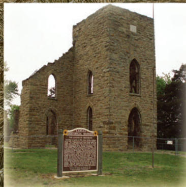
GREENBUSH/ ST. ALOYSIUS