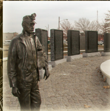
MINER'S MEMORIAL IN IMMIGRANT PARK