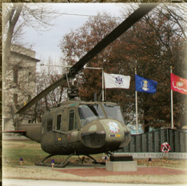
KANSAS VIETNAM VETERAN'S MEMORIAL