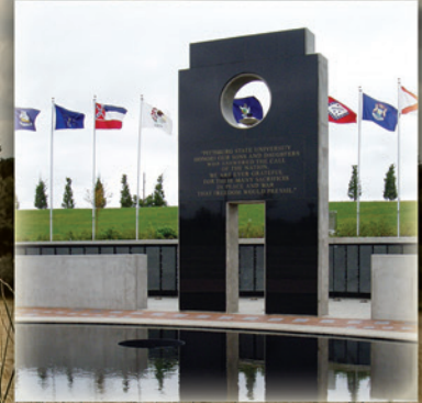
VETERAN'S MEMORIAL AMPHITHEATER