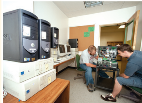
Students give a PC new life.

Departments of Social Sciences and Accounting, as well as the IRS Criminal Investigation unit, made the project possible. Students participating in the Adrian Project were invited to assume roles on a mock investigative team. The students received intense training on interviewing subjects and witnesses, surveillance techniques, analysis of documents and financial records, writing affidavits for search and arrest warrants, as well as being part of an undercover investigation. They were also given the opportunity to learn about employment in the field of financial investigation. Nearly 30 students with accounting and justice studies majors or fraud examination minors participated.