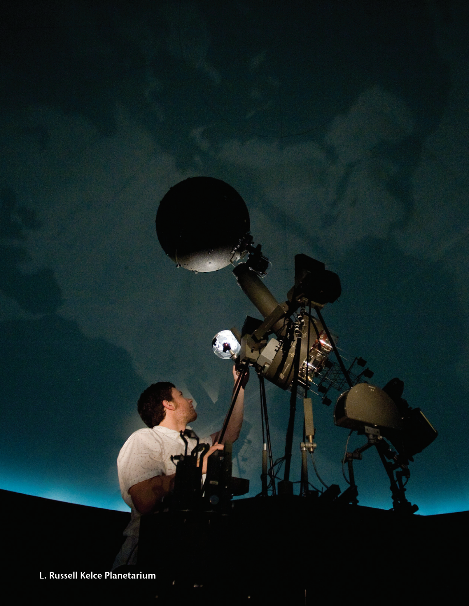
L. Russell Kelce Planetarium