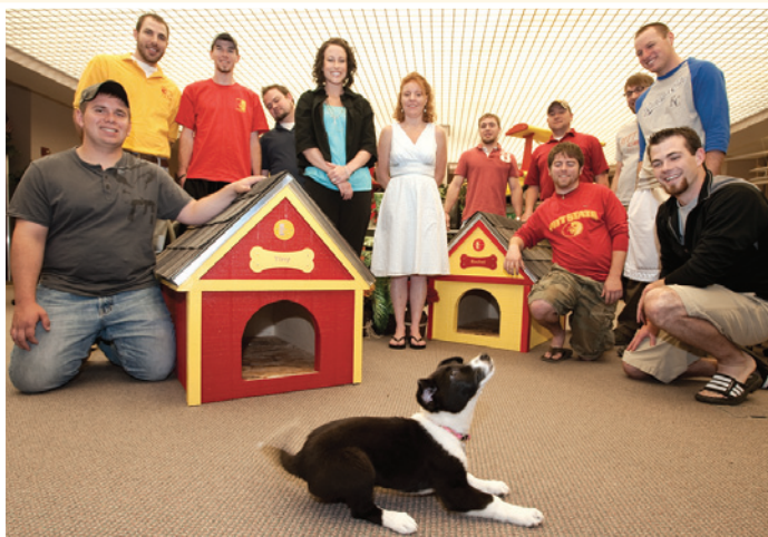
A puppy soon to have a new home seems excited about his bright, new dog house.

To contact the department, call 620-235-6555 or go to www.pittstate.edu/departments/construction.edu .