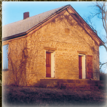
CATO SCHOOL HOUSE