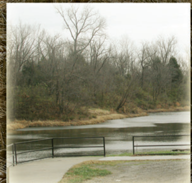
MINED LAND WILDLIFE AREA