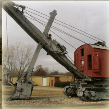
CRAWFORD CO. HISTORICAL MUSEUM