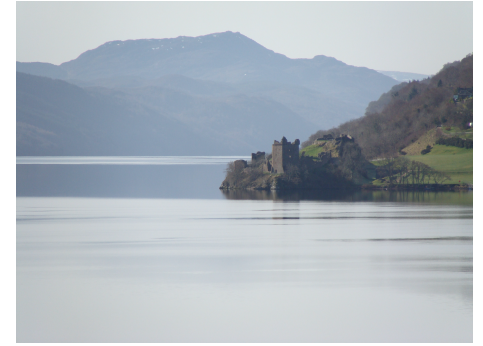
Urquhart Castle on Loch Ness

The trip will also include a three day stay in the Scottish Highlands.