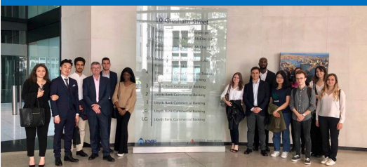
Visit to Lloyds bank