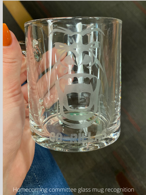
Homecoming committee glass mug recognition