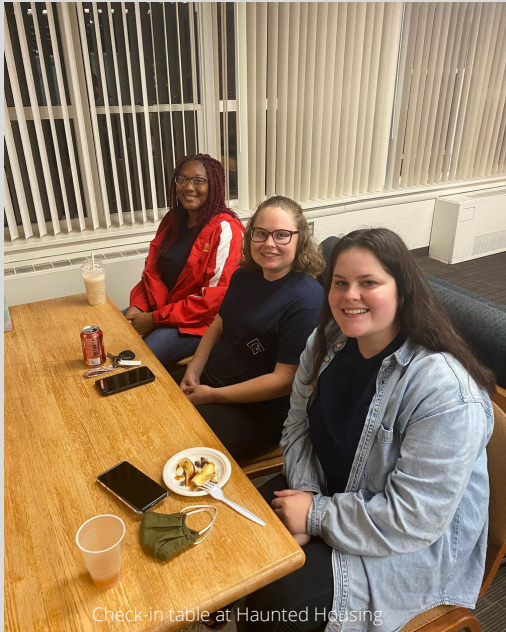
Check-in table at Haunted Housing