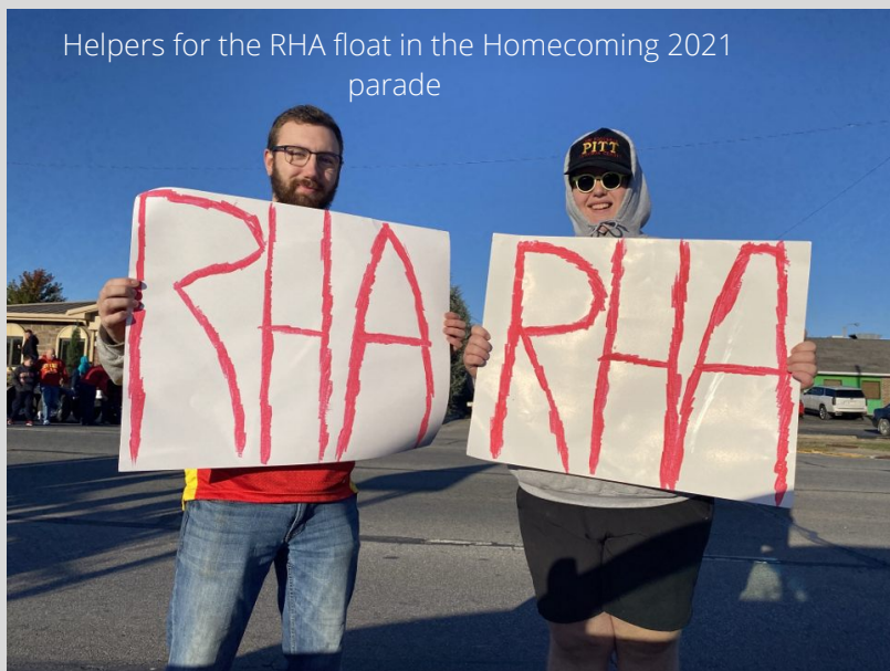
Helpers for the RHA float in the Homecoming 2021 parade

Homecoming was extremely fun to participate in this year, as this was my first time having a real homecoming experience for many on the executive board. While some challenges were faced while planning and preparing the car we rode in for the parade, it all worked out in the end. I really enjoyed getting to see my committees and my work come to life. Overall it was a fun experience that I would love to do again.