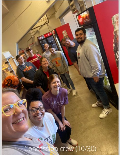
Concession crew (10/30)