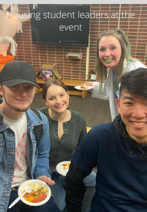
Housing student leaders at the event

On Halloween, the residence halls located on the north side of campus put on "Haunted Housing". While that was going on in the basement, the events committee was in the lobby and hosted a "DIY caramel apple bar". The Events Committee really turned out and did a lot to make this event successful. On the other hand, the RHA EBoard hosted a room called "The Deadly Farm". It all came together perfectly and I don't think it could have gone better.