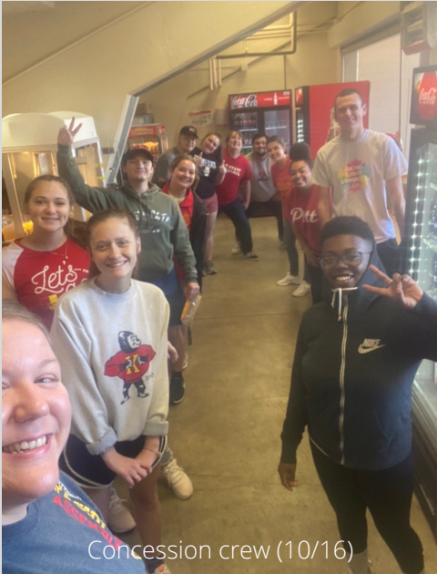
Concession crew (10/16)

For each home football game, RHA has the responsibility of getting 10 workers to work the stand. The money raised from each stand goes toward the RHA general budget. Enactus helped us work the concession stand on Oct 30 due to the demand of workers. Thank you Enactus for your support!