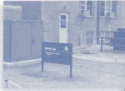
A new sign was placed outside Mitchell Hall to direct visitors.