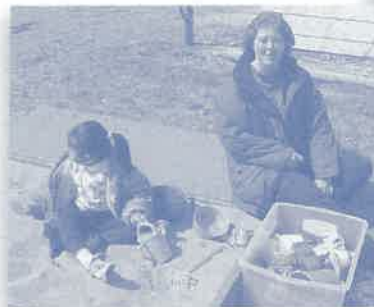
After a week of moving and resetting all equipment, the preschool resumed operation at the Hildebrandt house, on the east end of campus.