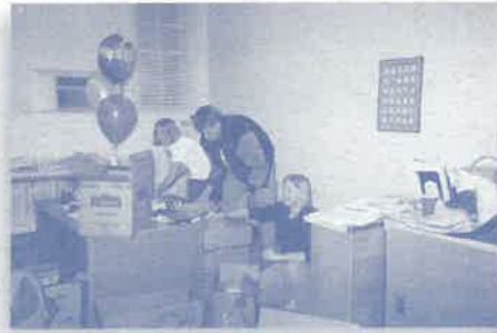
Within a 36-hour period, offices and classrooms were packed for relocation.

Anticipating renovation of Chandler Hall, a structural emergency required relocation to offices and classrooms around campus. A second move is anticipated to Whitesitt Hall prior to the beginning of the Fall 2001 semester.