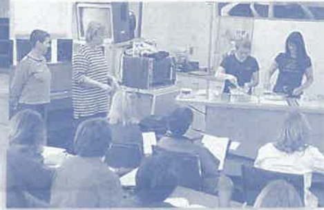
Students make good use of the portable demonstration table in Foods class at United Ministries Center.