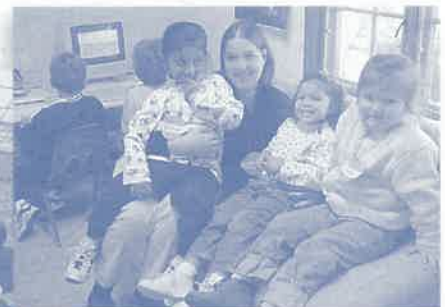
What was once the house's living room is now an activity space with many comfortable spots around the computer.