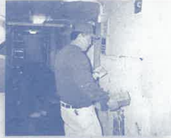
Before moving faculty and department offices to Mitchell Hall, rooms had to be cleared, cleaned and painted.