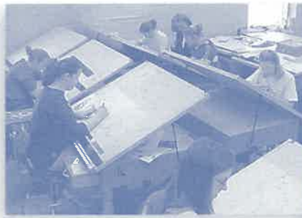
The Interior Design studio and sample room were moved to the Kansas Technology Center.