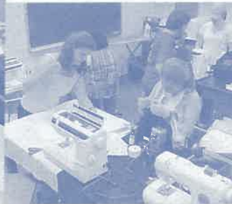
A small research laboratory in Heckert-Wells loaned by the Biology Department provided space for the construction lab.