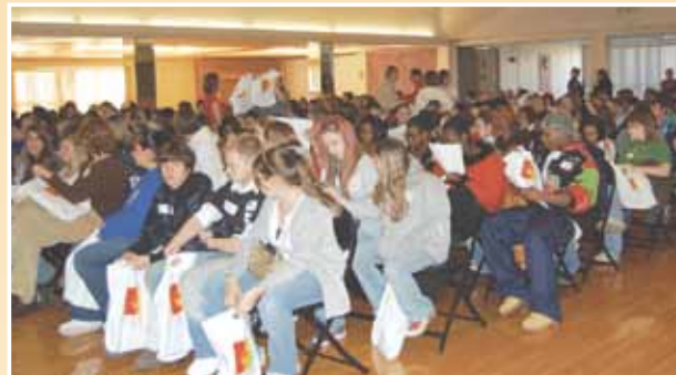
This year was a record year for attendance at the annual FCS Career Day, with more than 280 guests visiting our department.