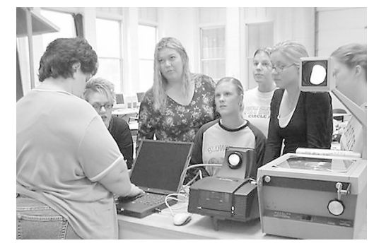
FCS Teacher Education students learn to setup equipment for Power Point presentations in Techniques For Teaching class.

CHECK OUT OUR WEB PAGE www.pittstate.edu/fcs/