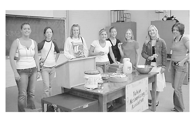
Fashion Merchandising Association students enjoy refreshments following a recent meeting.