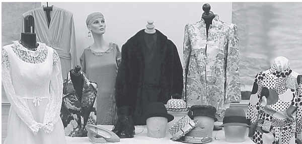
A display of garments from the Fashion Merchandising costume collection. Those shown above range from 1920 to 1970, but there are pieces in the collection that date as early as the 1870s.