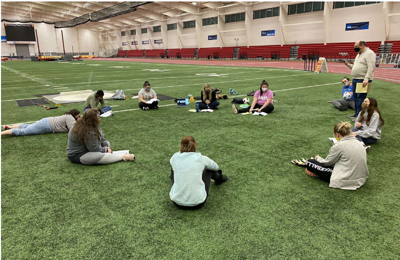
Cast members practicing lines on the turf