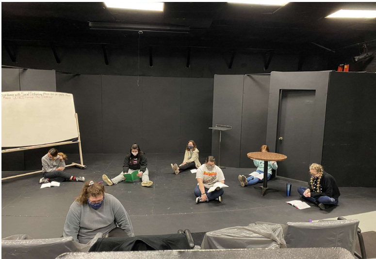
Cast members running lines