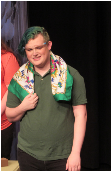
Cooper acting out a scene