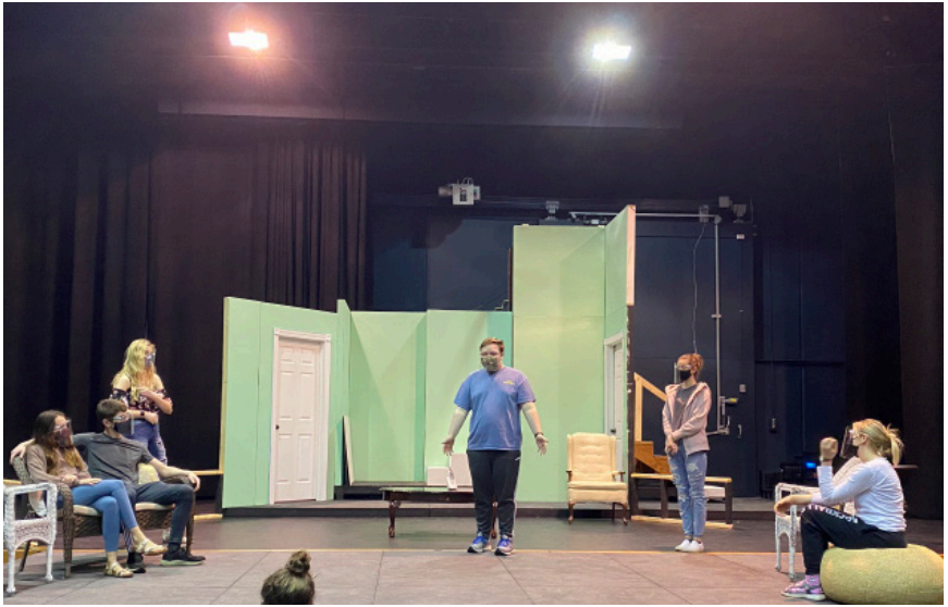
Entire cast during rehearsals