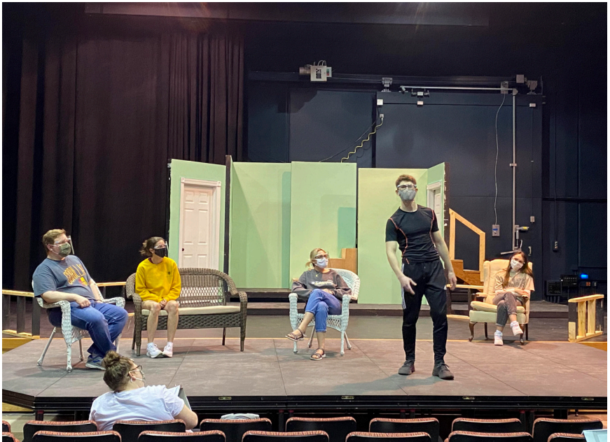
The cast running through lines