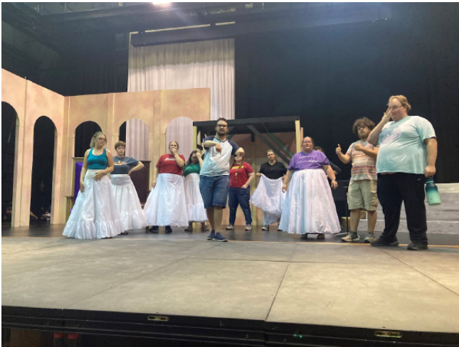
The cast prepare to rehearse a dance.

Follow us on Facebook @PippiMaesBoutique Tuesday-Friday 10-5:30 Saturday 10-4 Closed Sunday and Monday