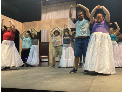
The cast rehearses the Spanish Panic.