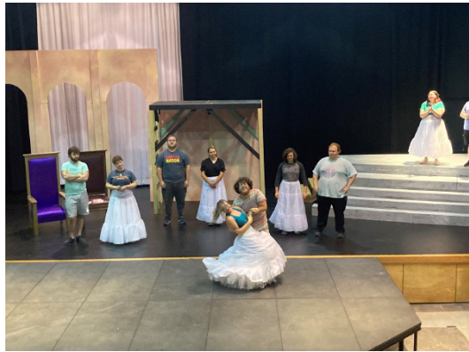
The cast rehearses for a scene in the Spanish Panic dance.