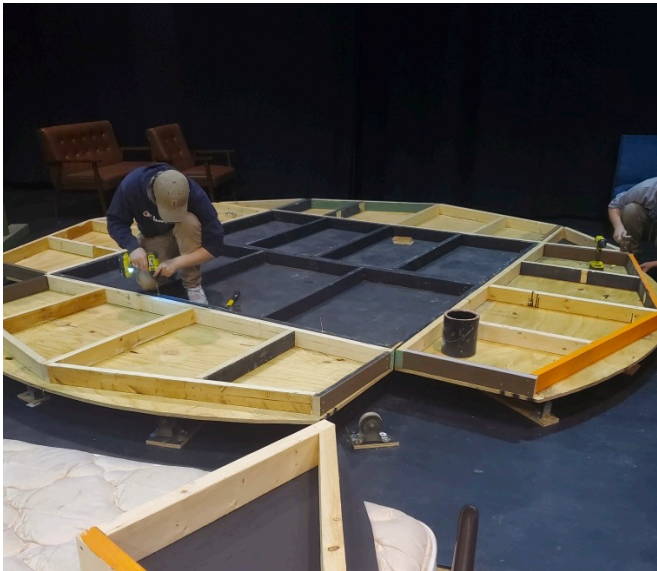
The support structure for the turntable gets installed