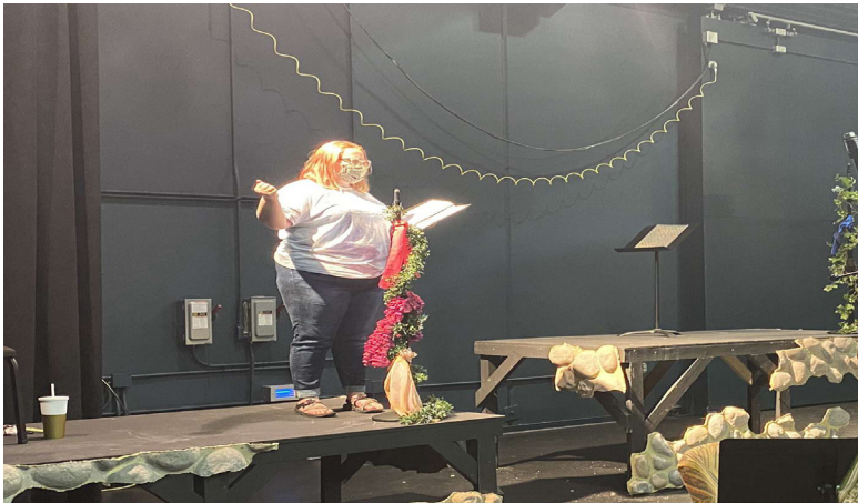
Agave speaking to audience