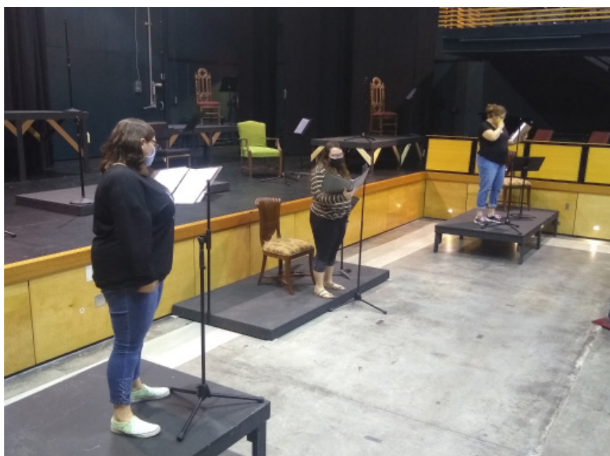
The Chorus speaking together