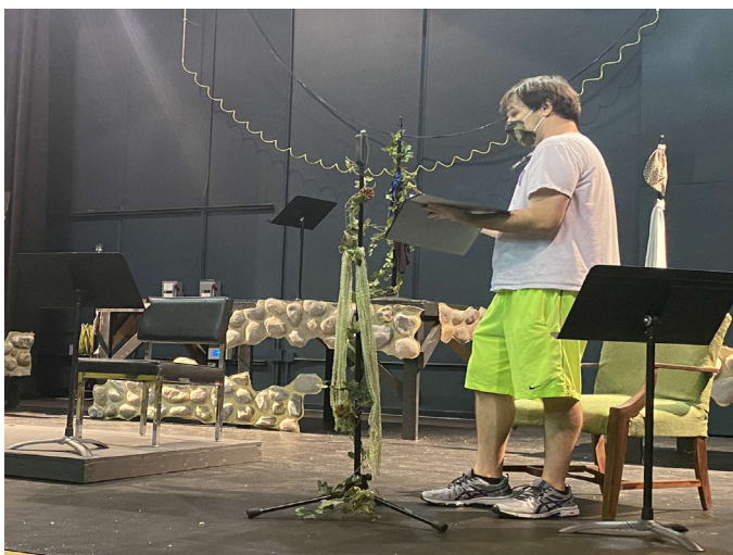
Cadmus reciting a message