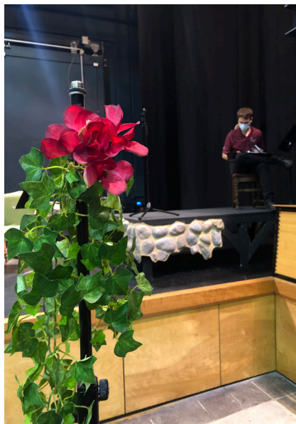
Vine prop featuring 2nd messenger