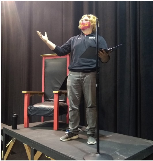
Dionysus proclaiming a message