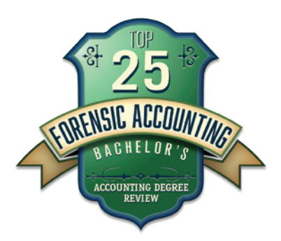
The Accounting Degree Review ranked Kelce's BBA accounting with minor in fraud examination degree the number 6 on the list of Top 25 Bachelor's Degrees in Forensic Accounting.