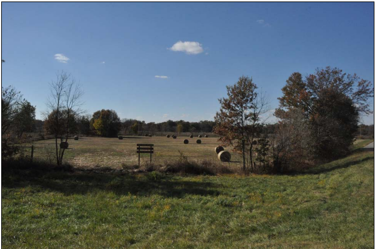
Robb Prairie after mowing (Nov. 2015). Looking west from HW-69.