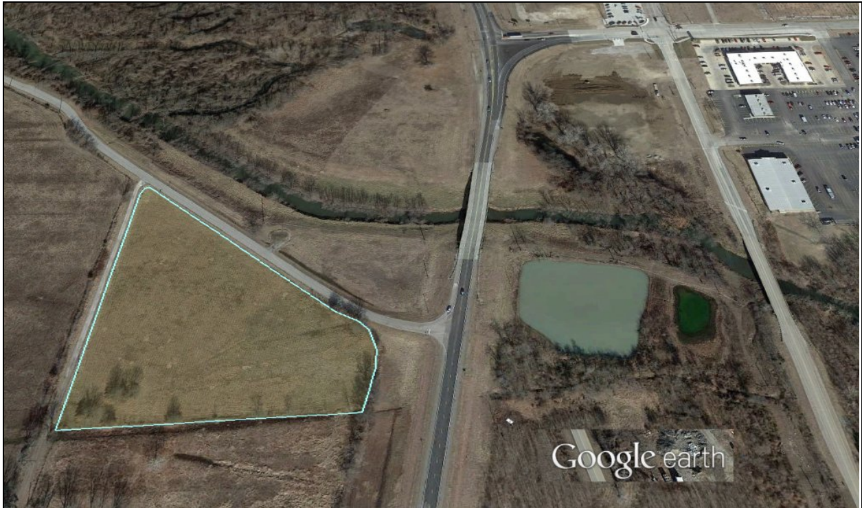
Robb Prairie next to US-69 south. Pittsburg mall to the right (east).