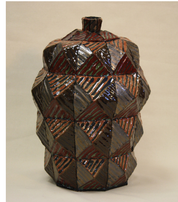
David Ingram, "Relief Quilt", Glazed stoneware, 15" X 21", 2013