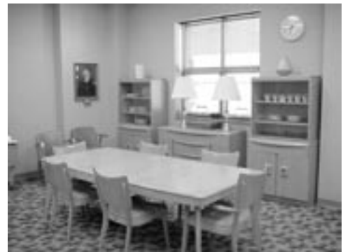
We have retained the historic Heywood Wakefield Furnishings in one special event room. Though we have moved into a new building, we are preserving important memories from our past.