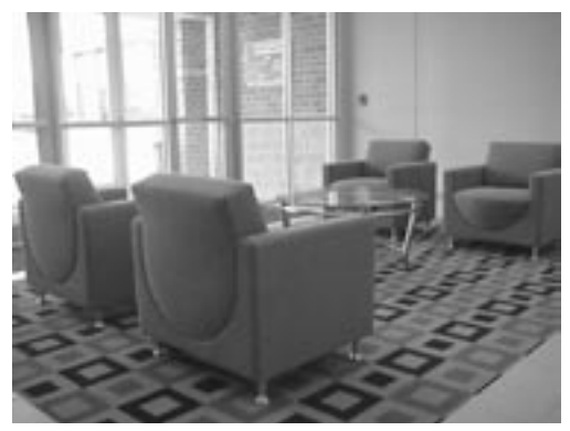
Lobby in Building Entrance