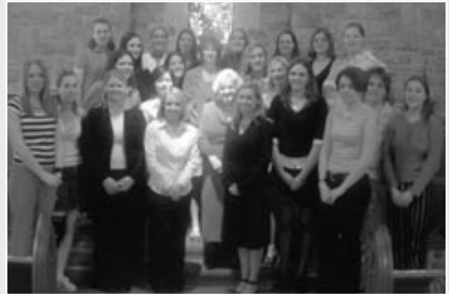
Phi Upsilon Omicron Honor Society membership at the spring initiation. Pictured are new inductees, current members and student leadership.