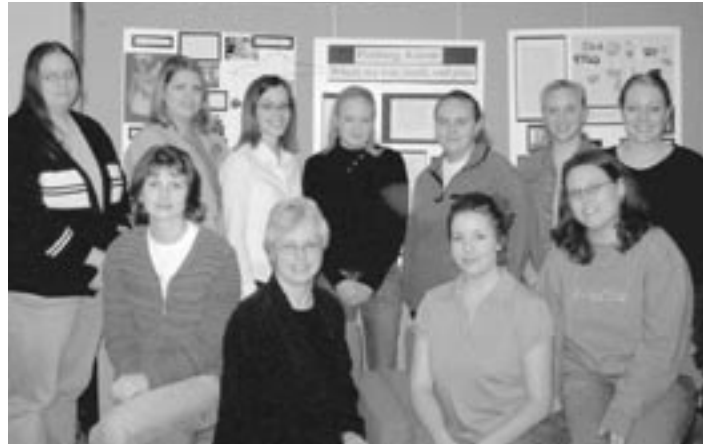
Early Childhood Development students are busy participating in the Early Childhood Student Organization. They have been involved in several service opportunities this year. They have also served meals at the Wesley House and provided childcare for the spring Parents University. Several students are also planning to take advantage of the opportunity to attend the Midwest AEYC Conference later this semester in Overland Park, Kan.

The members of the early childhood development faculty in Family and Consumer Sciences are working collaboratively with others interested in early childhood at PSU. Also we are participating in ECHO (Early Childhood Higher Education Options). This is a statewide group of higher education faculty who are committed to increasing access of Kansans to courses and programs leading to early childhood unified licensure through online delivery. These faculty members are working collaboratively to develop curriculum that meet the licensure standards, develop courses to be shared inter-institutionally, and to develop learning resources to support on-campus instruction. Currently the consortium members have developed inter-