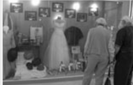
A historic display on dedication day that reflects life in the 1950's. This was the time when the department moved into the old Chandler building.