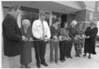
The University President, The Dean of Arts & Sciences, the FCS Chair, a FCS faculty member, a FCS student, and three alumni cut the ceremonial ribbon.