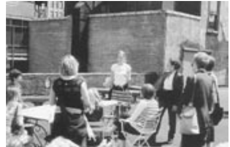
Students visit with a press associate on the rooftop of the Showroom Seven fashion studio, located in the heart of the garment district in New York City.