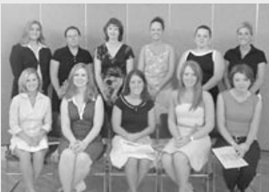
Current students receive awards.