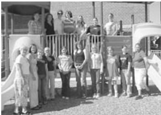
Early Childhood Student Organization on newly installed playground equipment.