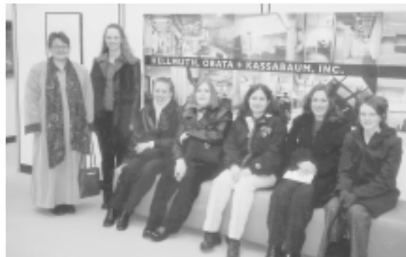
Interior Design and Fashion Merchandising students attend the WIM Meeting in Chicago during February of 2002. Students are shown during a tour of HOK Architecture & Interiors Firm.