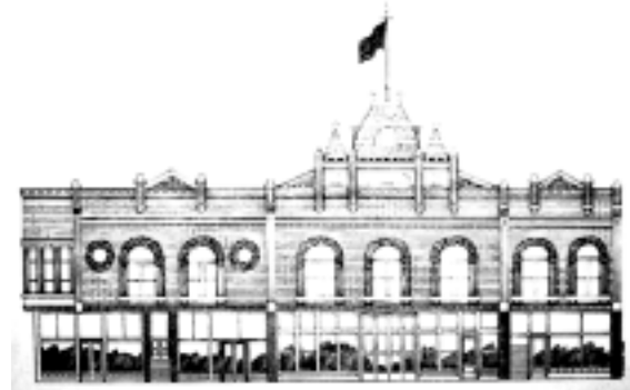
Red Men Hall, West 3rd Street