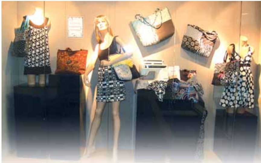
Students show off their work by displaying handbags created in a Construction Techniques course.