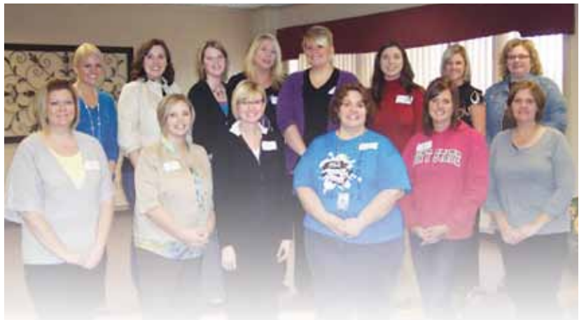
Alumni Promoting Our Profession—PSU's annual Career Day last November included an impressive number of former graduates who are now teaching FACS. By bringing their own students to our annual career fair, they are demonstrating their commitment to our profession.

In addition to Career Day, we also encourage our students to visit high school classrooms to share information about their individual area of study. To ask about a visit contact our office at 620-235-4457.